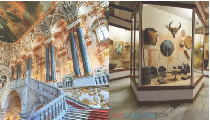
IELTS LISTENING – Student Accommodation S62T2 June 19, 2023 In "IELTS Listening"