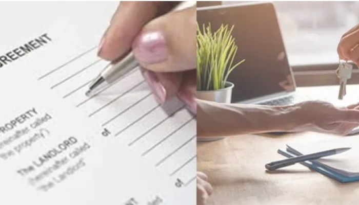
IELTS LISTENING – Tenancy Agreements and Other Legalities S44T2 December 22, 2022 In "IELTS Listening"