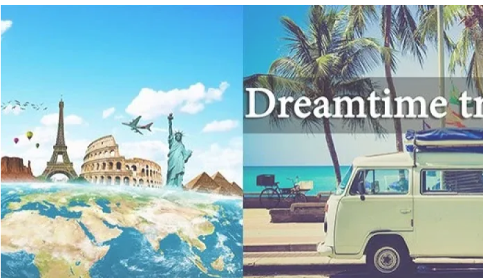
IELTS LISTENING – Dream Time Travel Agency Tour Information S29T1 November 23, 2022 In "IELTS Listening"