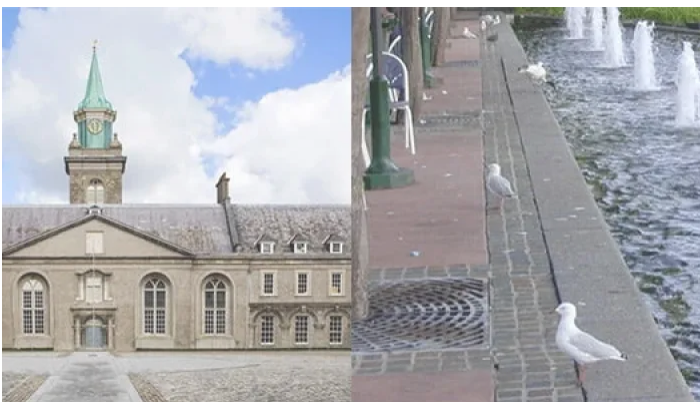
IELTS LISTENING – PACTON ON SEA BUS TOUR S5T2 June 20, 2025 In "IELTS Listening"