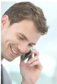
IELTS LISTENING – Accommodation form : Rental properties S10T1 July 1, 2025 In "IELTS Listening"