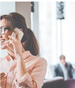
IELTS LISTENING – Hostel accommodation in darwin S11T1 July 1, 2025 In "IELTS Listening"