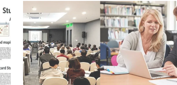
IELTS LISTENING – SEMINAR S13T3 June 26, 2025 In "IELTS Listening"