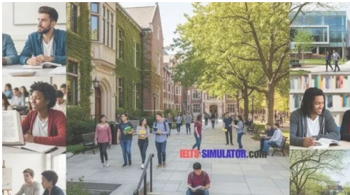
IELTS LISTENING – Enquiring about College Courses S33T3 July 10, 2025 In "IELTS Listening"