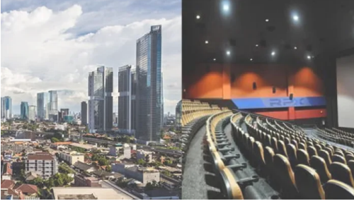
IELTS LISTENING – RIVENDEEN CITY THEATRE S33T2 December 8, 2022 In "IELTS Listening"