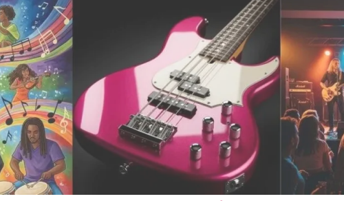
IELTS LISTENING- Musical Favourites S21T2 July 7, 2025 In "IELTS Listening"