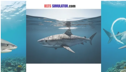
IELTS LISTENING – The Tiger Shark S61T4 July 18, 2025 In "IELTS Listening"