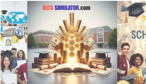
IELTS LISTENING – Scholarships and Funding S44T4 July 12, 2025 In "IELTS Listening"