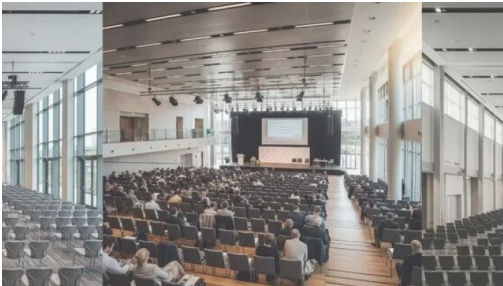
IELTS LISTENING – Conference Centre S36T1 July 11, 2025 In "IELTS Listening"