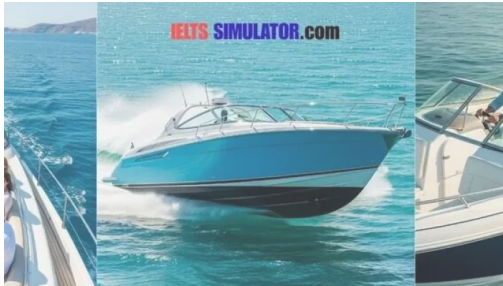
IELTS LISTENING – BOAT TRIP S38T2 July 11, 2025 In "IELTS Listening"