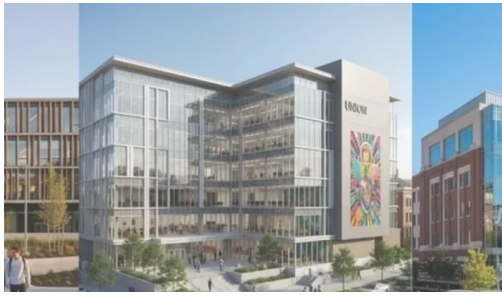
IELTS LISTENING – New Union Building S27T4 July 9, 2025 In "IELTS Listening"