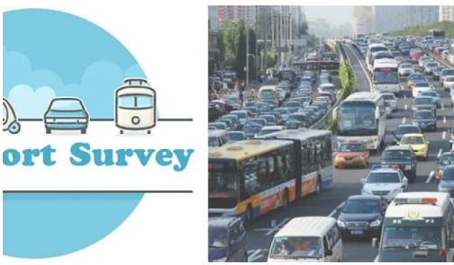
IELTS LISTENING – Transport Survey S15T1 July 2, 2025 In "IELTS Listening"