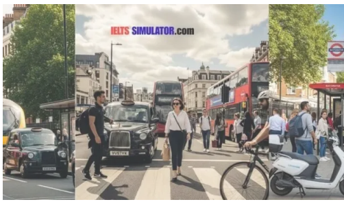
IELTS LISTENING – Transport from Bayswater S60T1 July 17, 2025 In "IELTS Listening"