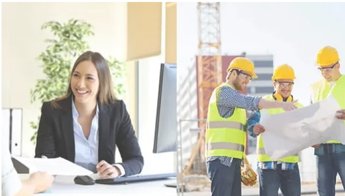
IELTS LISTENING – THORNDYKE'S BUILDERS S17T1 July 2, 2025 In "IELTS Listening"