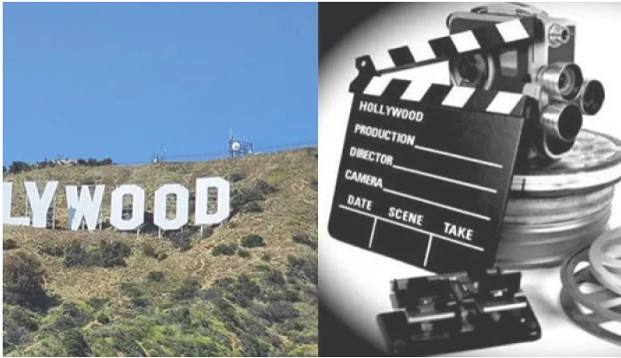
IELTS READING – The Hollywood Film Industry S12AT2 January 9, 2023 In "IELTS Reading Academic"