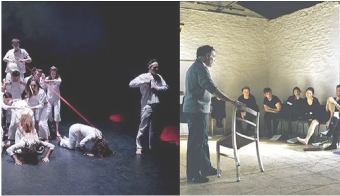
IELTS READING – THE OXFORD SCHOOL OF DRAMA S13GT2 March 19, 2020 In "IELTS Reading Easy Demo for GT"