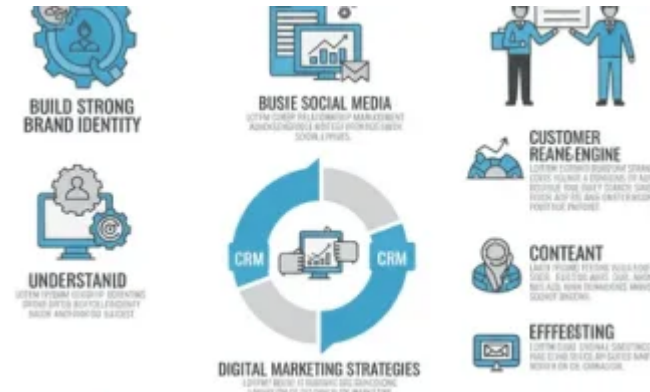
IELTS READING – Marketing advice for new businesses S1GT3 July 11, 2025 In "IELTS Reading Easy Demo for GT"

IELTS READING – NETSCAPE S26GT4 IELTS READING NETSCAPE NETSCAPE File Edit View Go Communication Help CONTENTS: ARTHUR PHILLIP COLLEGE Attempt full reading test... January 12, 2020 In "IELTS Reading GT – Format, Tips, and Practice for General Training"