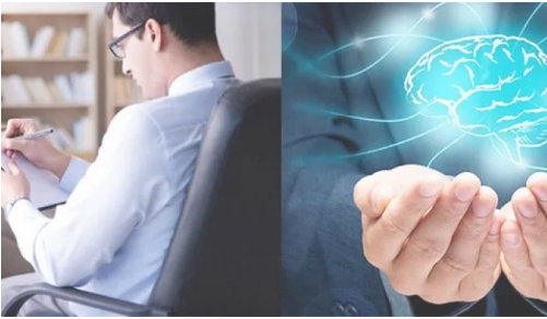
IELTS LISTENING – Joanna’s psychology study S4T3 June 27, 2025 In "IELTS Listening"