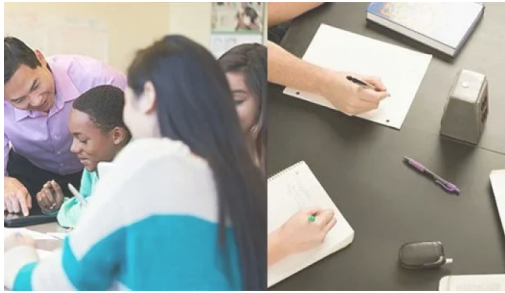
IELTS LISTENING – DETAILS OF ASSIGNMENT S26T3 November 22, 2022 In "IELTS Listening"