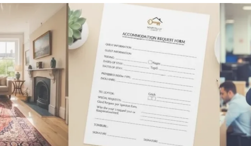
IELTS LISTENING – Accommodation Request Form S27T1 July 4, 2025 In "IELTS Listening"