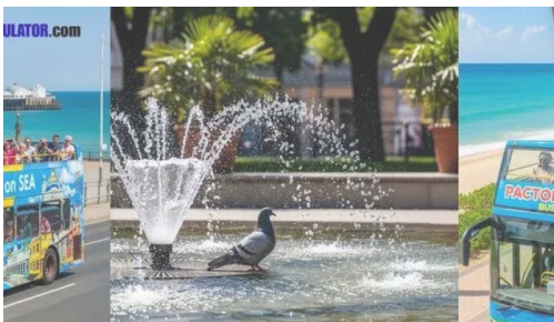
IELTS LISTENING – PACTON ON SEA BUS TOUR S5T2 July 4, 2025 In "IELTS Listening"