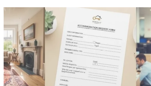
IELTS LISTENING – Accommodation Request Form S27T1 July 9, 2025 In "IELTS Listening"