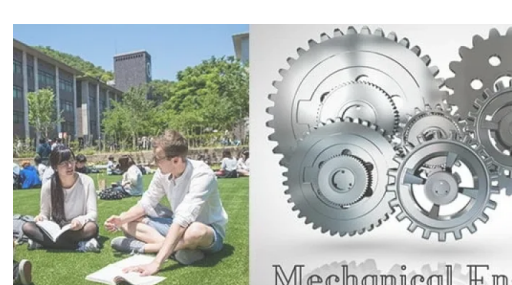
IELTS LISTENING – UNIVERSITY LIFE S6T3 June 27, 2025 In "IELTS Listening"