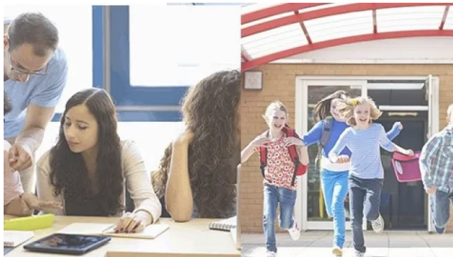
IELTS LISTENING – Jobs People can get in School S42T4 December 20, 2022 In "IELTS Listening"