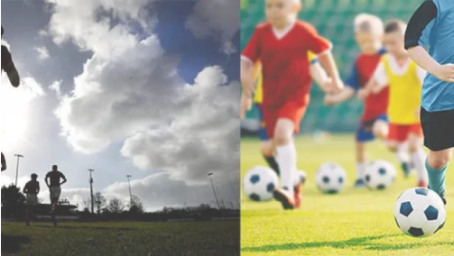
IELTS LISTENING – Notes on Sports Club S33T1 December 8, 2022 In "IELTS Listening"