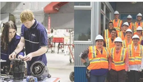
IELTS LISTENING – Induction talk for new Apprentices S16T2 July 2, 2025 In "IELTS Listening"