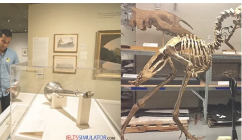
IELTS LISTENING – Basement of Museum S4T2 June 27, 2025 In "IELTS Listening"