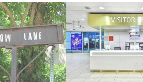
IELTS LISTENING – TOURIST INFORMATION CENTRE S9T2 July 1, 2025 In "IELTS Listening"