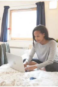
IELTS LISTENING – Student Accommodation S62T1 June 16, 2023 In "IELTS Listening"