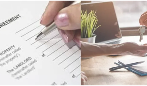
IELTS LISTENING – Tenancy Agreements and Other Legalities S44T2 December 22, 2022 In "IELTS Listening"