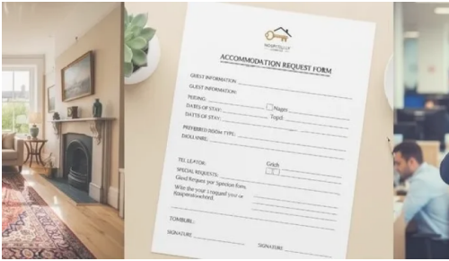
IELTS LISTENING – Accommodation Request Form S27T1 July 9, 2025 In "IELTS Listening"