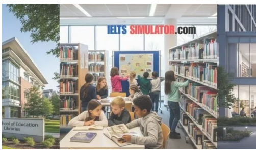
IELTS LISTENING – The School of Education Libraries S36T3 July 11, 2025 In "IELTS Listening"