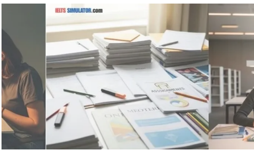
IELTS LISTENING – DETAILS OF ASSIGNMENT S26T3 July 9, 2025 In "IELTS Listening"