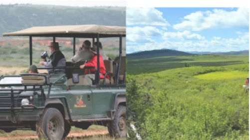
IELTS READING – The Impact of Wilderness Tourism S32AT1 February 24, 2023 In "IELTS Reading Academic"