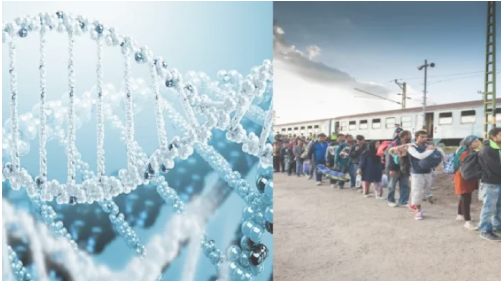
IELTS READING – Population movements and genetics S39AT2 March 10, 2023 In "IELTS Reading Academic"