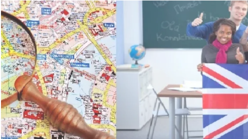
IELTS READING – GOOD REASONS FOR CHOOSING ATLAS ENGLISH LANGUAGE COLLEGE S21GT4 September 7, 2019 In "IELTS Reading GT"