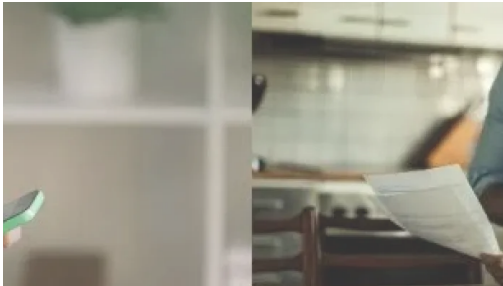
IELTS READING – The name of your medicine is Borodine tablets. S20GT2 August 25, 2019 In "IELTS Reading GT"