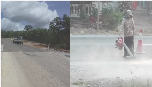
IELTS READING – MAIN STREET, GATTON RE-DEVELOPMENT S22GT2 September 18, 2019 In "IELTS Reading GT"