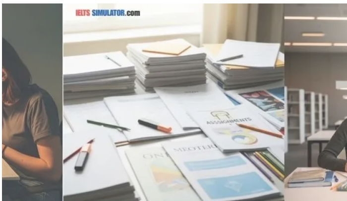
IELTS LISTENING – DETAILS OF ASSIGNMENT S26T3 July 9, 2025 In "IELTS Listening"