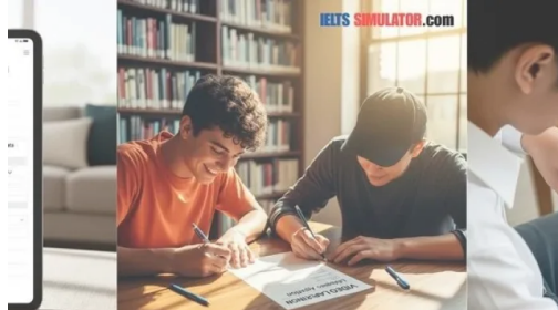
IELTS LISTENING – VIDEO LIBRARY APPLICATION FORM S42T1 July 11, 2025 In "IELTS Listening"