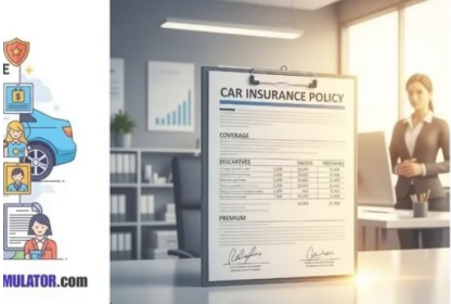
IELTS LISTENING – CAR INSURANCE S38T1 July 11, 2025 In "IELTS Listening"