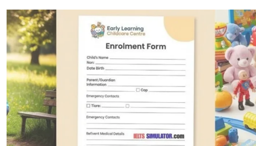
IELTS LISTENING – Early Learning Childcare Centre Enrolment Form S18T1 July 5, 2025 In "IELTS Listening"