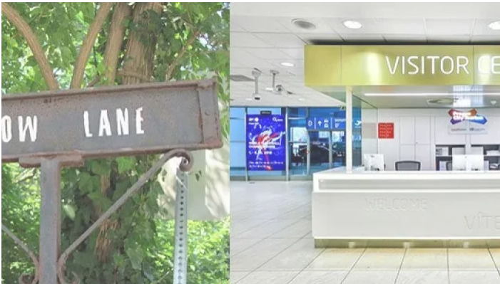
IELTS LISTENING – TOURIST INFORMATION CENTRE S9T2 July 1, 2025 In "IELTS Listening"