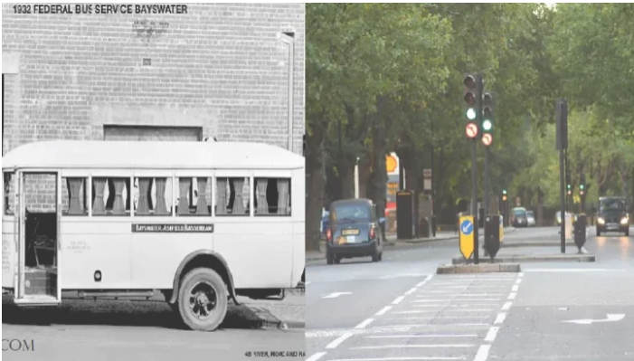
IELTS LISTENING – Transport from Bayswater S60T1 June 9, 2023 In "IELTS Listening"