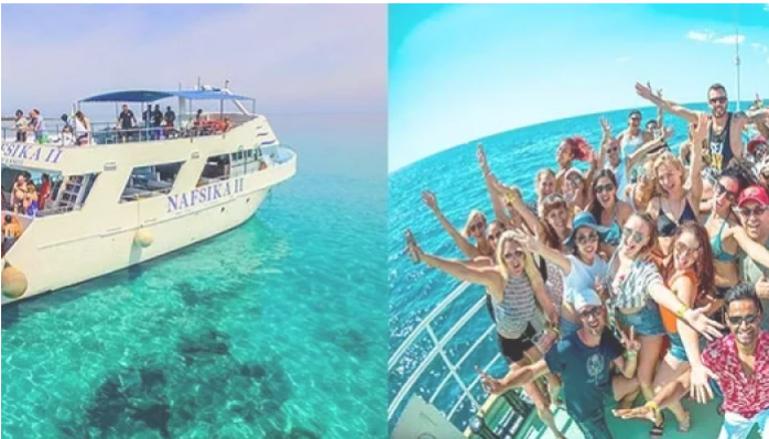
IELTS LISTENING – BOAT TRIP S38T2 December 8, 2022 In "IELTS Listening"