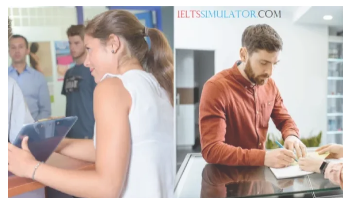
IELTS LISTENING – Programme of Activities for First Day S50T1 April 5, 2023 In "IELTS Listening"