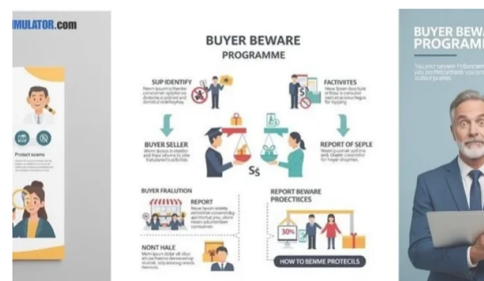
IELTS LISTENING – "Buyer Beware" Programme S29T2 July 9, 2025 In "IELTS Listening"