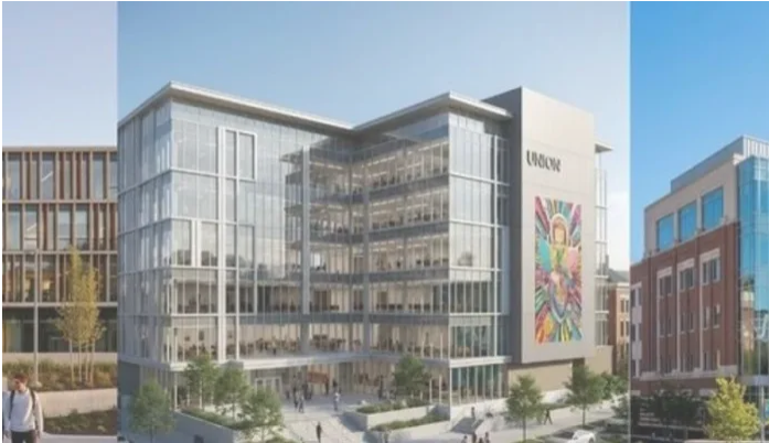
IELTS LISTENING – New Union Building S27T4 July 9, 2025 In "IELTS Listening"