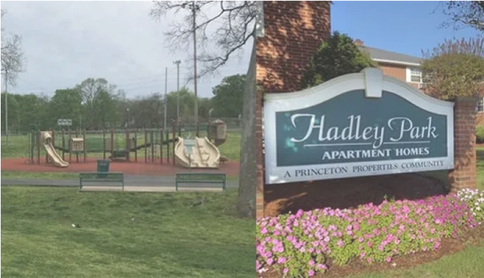
IELTS LISTENING – Hadley Park Community Gardens Project S8T2 July 1, 2025 In "IELTS Listening"