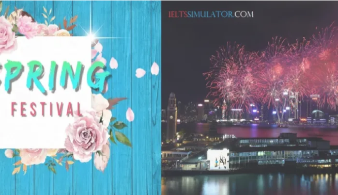
IELTS LISTENING – Spring Festival S59T2 June 8, 2023 In "IELTS Listening"