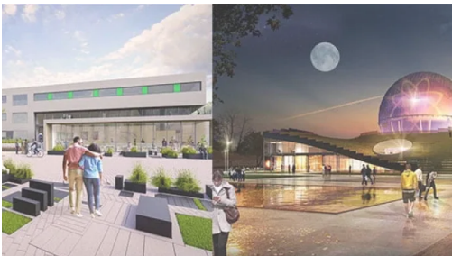
IELTS LISTENING – Global Design Competition S14T3 July 2, 2025 In "IELTS Listening"