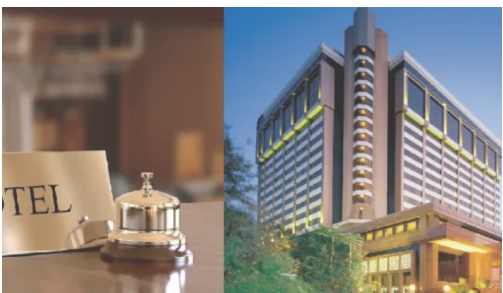
IELTS LISTENING – HOTELS S64T1 June 23, 2023 In "IELTS Listening"