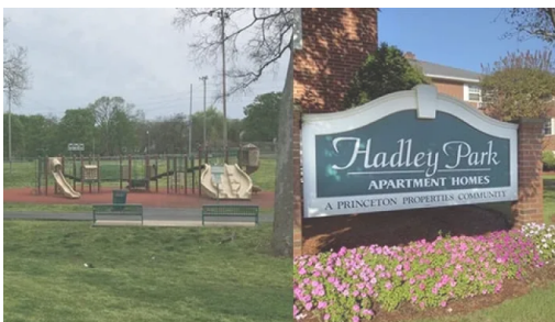
IELTS LISTENING – Hadley Park Community Gardens Project S8T2 July 1, 2025 In "IELTS Listening"