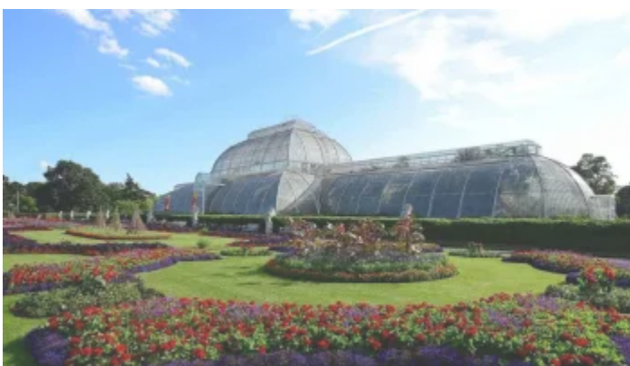
IELTS READING TEST SET 10 TASK 1 GT – Summer activities at London's Kew Gardens June 29, 2019 In "IELTS Reading GT – Format, Tips, and Practice for General Training"