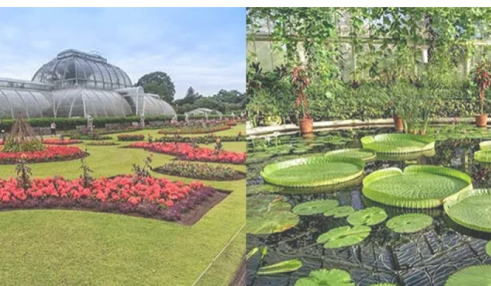
IELTS READING – Summer activities at London's Kew Gardens S10GT1 March 8, 2020 In "IELTS Reading Easy Demo for GT"