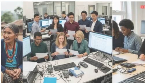
IELTS READING – Obtaining Linguistic Data S27AT3 July 25, 2025 In "IELTS Reading Academic"