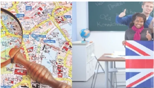
IELTS READING – GOOD REASONS FOR CHOOSING ATLAS ENGLISH LANGUAGE COLLEGE S21GT4 September 7, 2019 In "IELTS Reading GT – Format, Tips, and Practice for General Training"