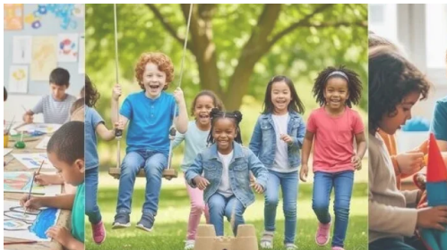
IELTS READING – THE IMPORTANCE OF CHILDREN'S PLAY S16AT1 July 23, 2025 In "IELTS Reading Academic"