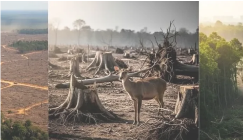
IELTS READING – Deforestation in the 21st century S13AT2 July 22, 2025 In "IELTS Reading Academic"