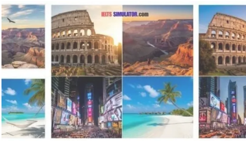
IELTS READING – Some places to visit S6GT1 August 1, 2025 In "IELTS Reading Easy Demo for GT"

Tagged IELTS Academic Reading, Top 10 IELTS Reading Tips to Improve Band Score Fast