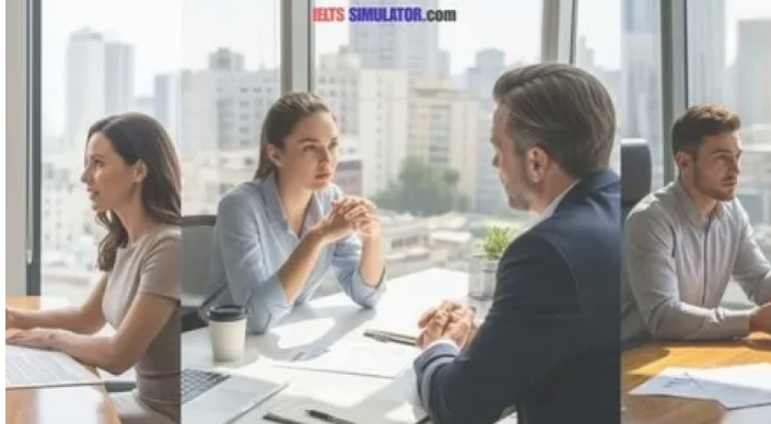
IELTS READING – Negotiating a better salary package for your new job S4GT3 July 31, 2025 In "IELTS Reading Easy Demo for GT"

Tagged Top 10 IELTS Reading Tips to Improve Band Score Fast , How Technology is Changing Our Lives” – IELTS 4-Module Practice Topic