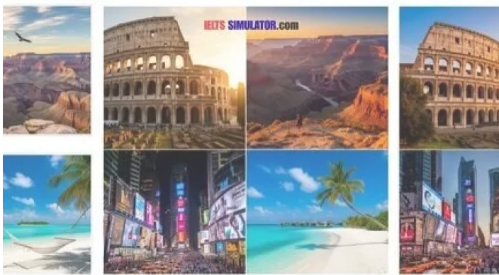
IELTS READING – Some places to visit S6GT1 August 1, 2025 In "IELTS Reading Easy Demo for GT"