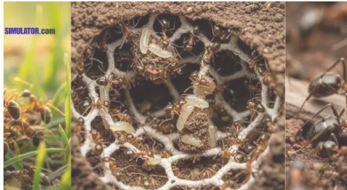
IELTS Reading-The Return of Artificial Intelligence S31AT3 July 28, 2025 In "IELTS Reading Academic"

Tagged IELTS Academic Reading , Top 10 IELTS Reading Tips to Improve Band Score Fast