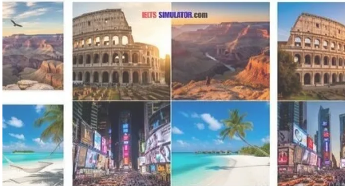
IELTS READING – Some places to visit S6GT1 August 1, 2025 In "IELTS Reading Easy Demo for GT"