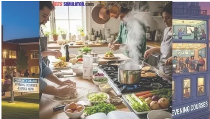
IELTS READING – Evening Courses S3GT1 July 31, 2025 In "IELTS Reading Easy Demo for GT"

Tagged Top 10 IELTS Reading Tips to Improve Band Score Fast , How Technology is Changing Our Lives – IELTS 4-Module Practice Topic