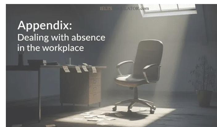
IELTS READING – Appendix: Dealing with absence in the workplace S13GT4 August 12, 2025 In "IELTS Reading Easy Demo for GT"