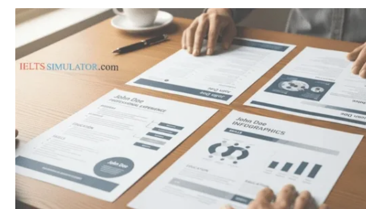
IELTS READING – Choosing the right format for your CV S14GT4