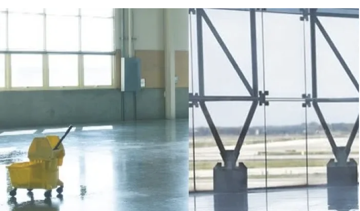
IELTS READING – A case study of a risk assessment for general office cleaning S16GT3