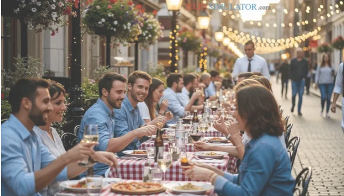
IELTS READING – DINING OUT S21GT1 August 16, 2025 In "IELTS Reading GT – Format, Tips, and Practice for General Training"