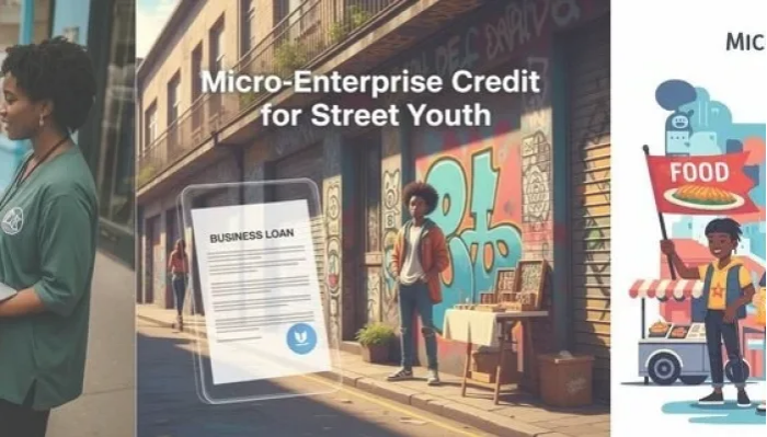
IELTS READING – Micro-Enterprise Credit for Street Youth S27AT1 July 25, 2025 In "IELTS Reading Academic"