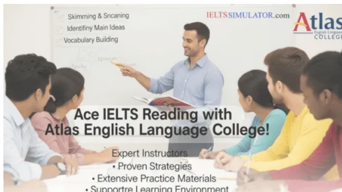
IELTS READING – GOOD REASONS FOR CHOOSING ATLAS ENGLISH LANGUAGE COLLEGE S21GT4

In "IELTS Reading GT – Format, Tips, and Practice for General Training"