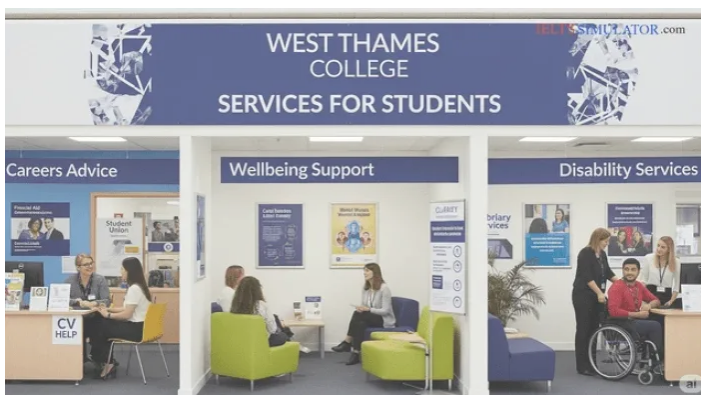
IELTS READING – WEST THAMES COLLEGE SERVICES FOR STUDENTS S20GT4

In "IELTS Reading GT – Format, Tips, and Practice for General Training"