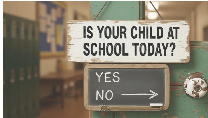
IELTS READING – Is Your Child at School Today? S8GT1 August 5, 2025 In "IELTS Reading Easy Demo for GT"

Tagged Top 10 IELTS Reading Tips to Improve Band Score Fast , ✔ "How Technology is Changing Our Lives" – IELTS 4-Module Practice Topic