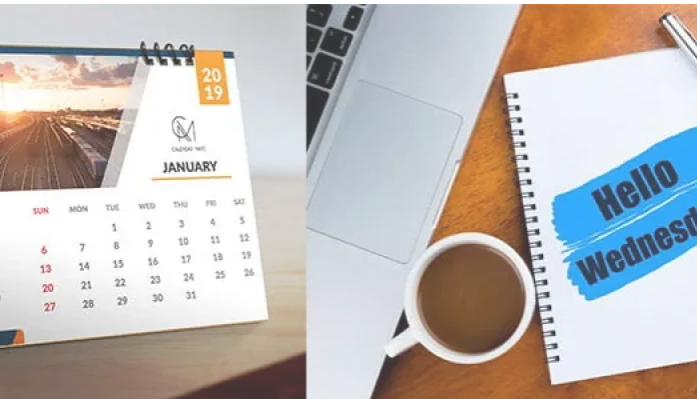
IELTS READING – The Week’s Best S28GT2 January 27, 2020 In "IELTS Reading GT – Format, Tips, and Practice for General Training"