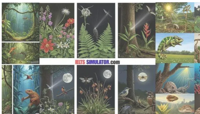
IELTS READING – The effects of light on plant and animal species S32AT3 July 28, 2025 In "IELTS Reading Academic"

Tagged IELTS Reading Matching Headings Questions – Strategy & Practice , Top 10 IELTS Reading Tips to Improve Band Score Fast