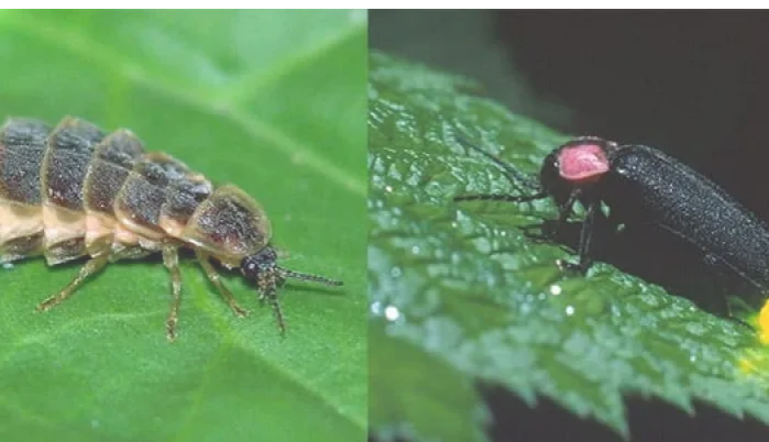
IELTS READING – Glow-worms S28GT5 February 1, 2020 In "IELTS Reading Easy Demo for GT"