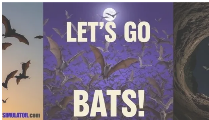
IELTS READING – Let's Go Bats – S37AT1 July 29, 2025 In "IELTS Reading Academic"