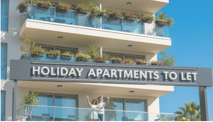
IELTS READING – HOLIDAY APARTMENTS TO LET S8GT2 August 5, 2025 In "IELTS Reading Easy Demo for GT"