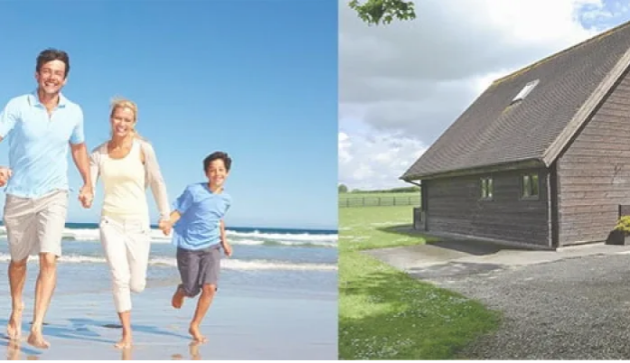
IELTS READING – Booking a Wessex Cottages Holiday S29GT1 January 13, 2020 In "IELTS Reading GT – Format, Tips, and Practice for General Training"