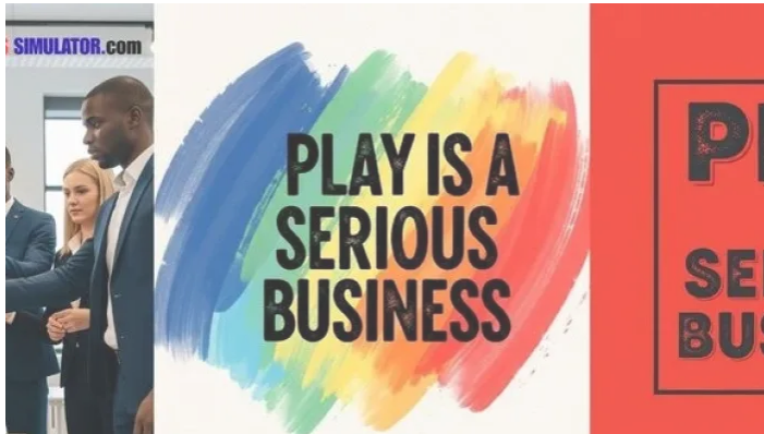
IELTS READING – Play is a serious business S26AT3 July 25, 2025 In "IELTS Reading Academic"