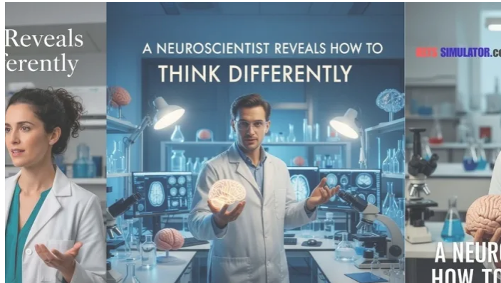
IELTS READING – A Neuroscientist Reveals How to Think Differently S46AT3 August 1, 2025 In "IELTS Reading Academic"

Tagged IELTS Reading Matching Headings Questions – Strategy & Practice , Top 10 IELTS Reading Tips to Improve Band Score Fast