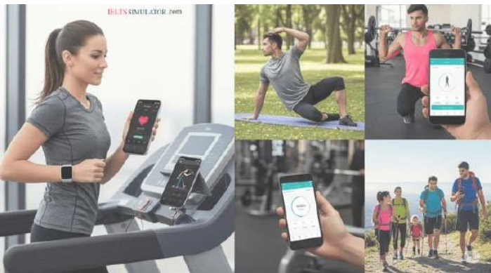
IELTS READING – Smartphone fitness apps S14GT2