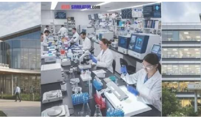
IELTS READING – Biological Research Institute S4GT2