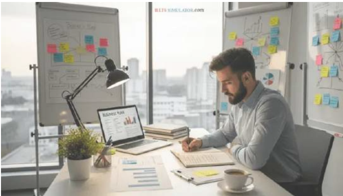
IELTS READING – Setting up your own business S11GT4 August 11, 2025 In "IELTS Reading Easy Demo for GT"