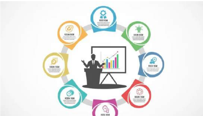
IELTS READING – Tips for giving an effective business presentation S9GT3 August 7, 2025 In "IELTS Reading Easy Demo for GT"

Tagged IELTS Reading Matching Headings Questions – Strategy & Practice , Top 10 IELTS Reading Tips to Improve Band Score Fast