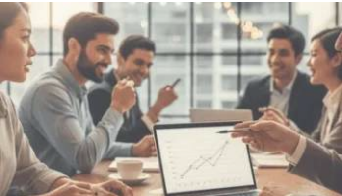
IELTS READING – THE BENEFITS OF HAVING A BUSINESS MENTOR S6GT3 August 1, 2025 In "IELTS Reading Easy Demo for GT"