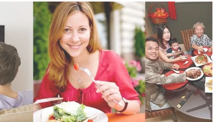
IELTS SPEAKING – YOUR LIFE S9 March 7, 2020 In "IELTS Speaking – Tips, Practice & Band Boost Guide"