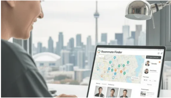
IELTS READING – Online roommate finder: Toronto S14GT1 August 12, 2025 In "IELTS Reading Easy Demo for GT"