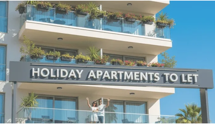
IELTS READING – HOLIDAY APARTMENTS TO LET S8GT2 August 5, 2025 In "IELTS Reading Easy Demo for GT"