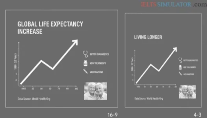
IELTS WRITING – improved medical care is that people are living longer S6AT2 September 9, 2025 In "IELTS Academic Writing – Task 1 & 2 Format, Tips, and Sample Answers"