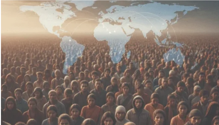
IELTS WRITING – Rise in the world’s population is the greatest problem S11AT2 September 8, 2025 In "IELTS Academic Writing – Task 1 & 2 Format, Tips, and Sample Answers"